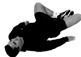
Supine Groin Stretch