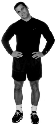
Side of Neck Stretch