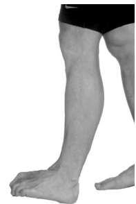
Toe Flexion Stretch