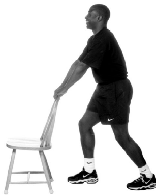
Inner Calf Stretch