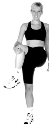
Side of Buttock Stretch