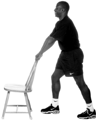
Outer Calf Stretch