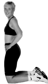
Half Kneeling Shin Stretch