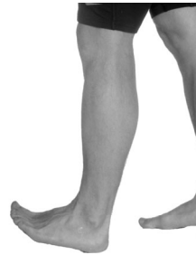
Toe Extension Stretch