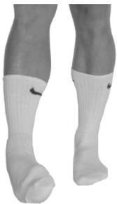
Outer Ankle Stretch