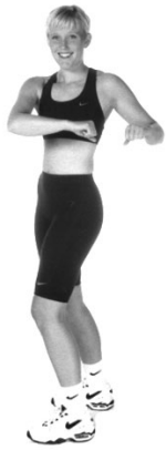
Spinal Twist Stretch