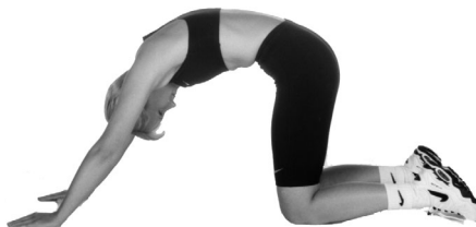
Back Flexion Stretch