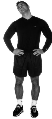
Front of Neck Stretch