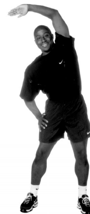
Side of Spine Stretch