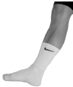
Inner Ankle Stretch